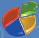
Chart FX 7

Chart FX isn't your typical new version but a completely re-engineered data visualization solution. By taking full advantage of Visual Studio and the ASP.NET 2.0 specific features, Chart FX again raises the bar to a level that other charting components won't be able to reach.